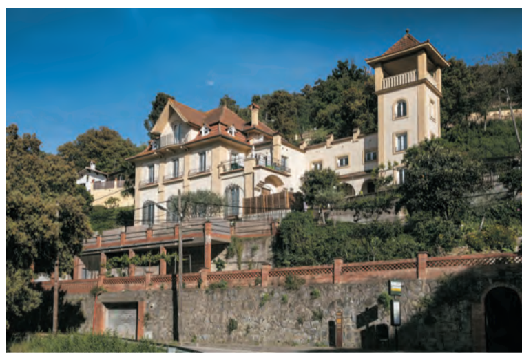
Sanatori del Fumet