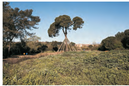
Pi d'en Xandri

Located in a valley called the Vall de Gausac, this farmhouse lies halfway along the traditional road from Sant Cugat to Sant Medir. The current structure dates to the 18th century. Nearby sits the pond of Can Borrell, which collected water that was redirected to the farmhouse for agricultural uses.