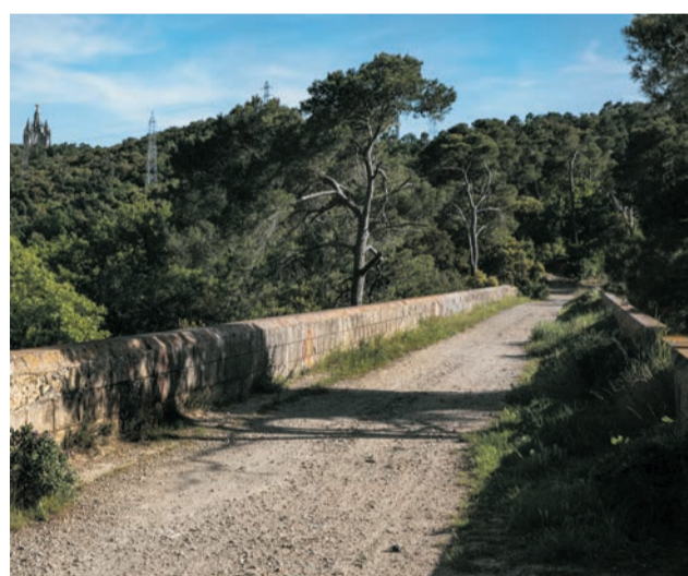
Viaduct of Can Ribes

A set of three fountains located at the edge of a wide, flat clearing. These are made of stonework with cement rendering around the edges, with a bulky, irregular appearance that resembles Antoni Gaudí's work at La Pedrera.