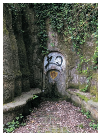
Font de la Rabassada