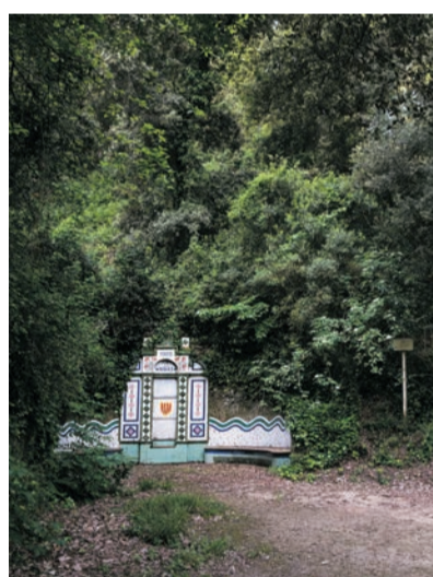
Font d'en Ribes