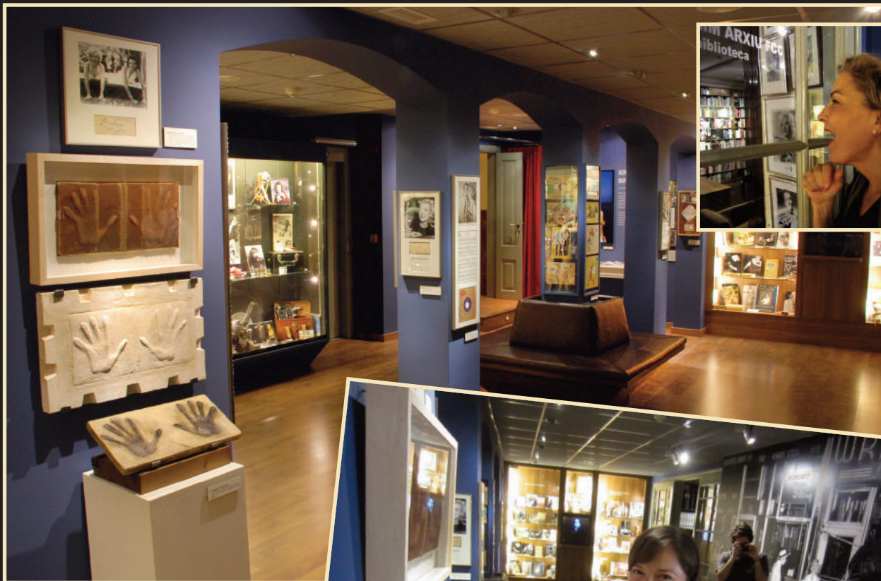
The exhibit of Marilyn Monroe memorabilia